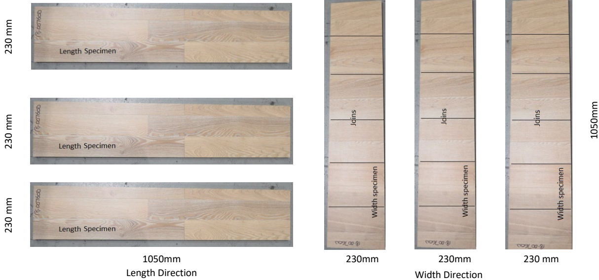
3 x Width direction samples